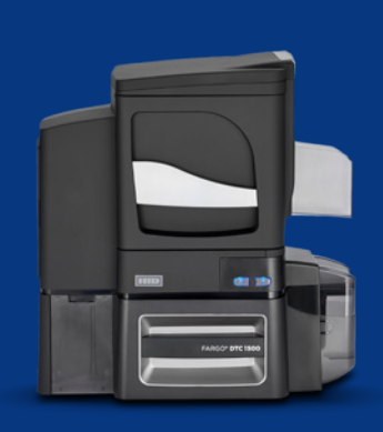
HID FARGO DTC1500 featured with optional lamination